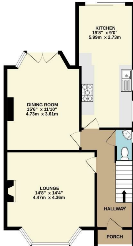
GROUND FLOOR 650 sq.ft. (60.4 sq.m.) approx.